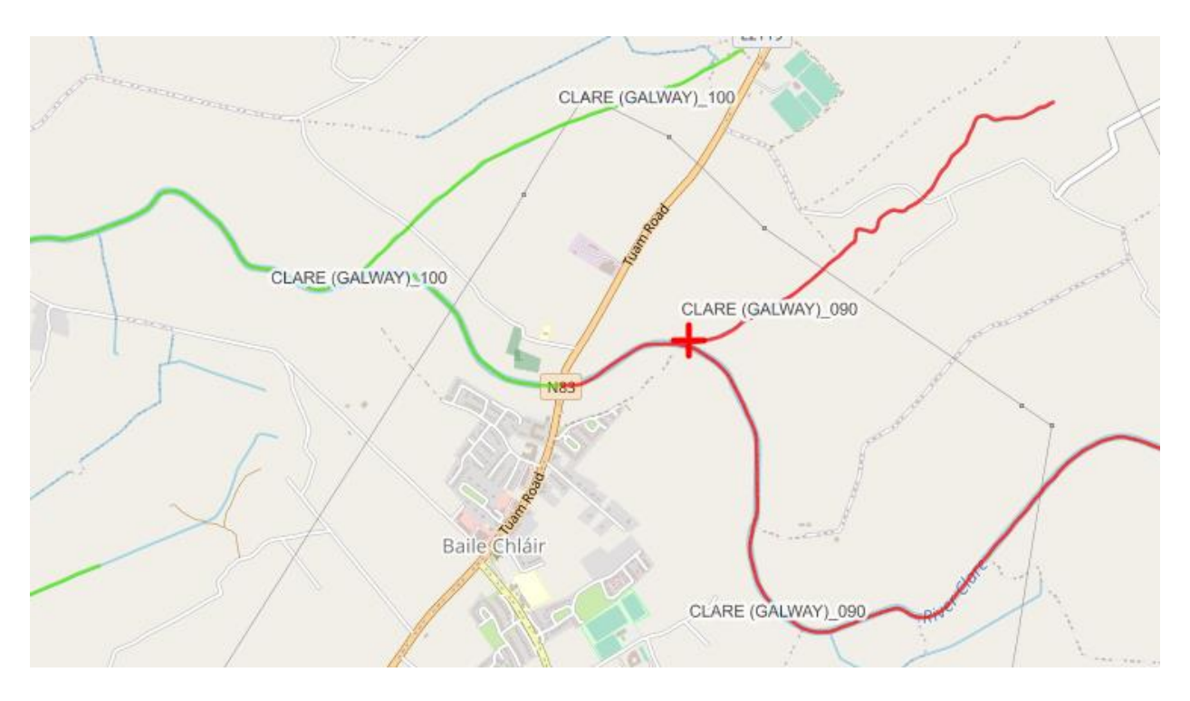
Project 3. River Clare at Claregalway